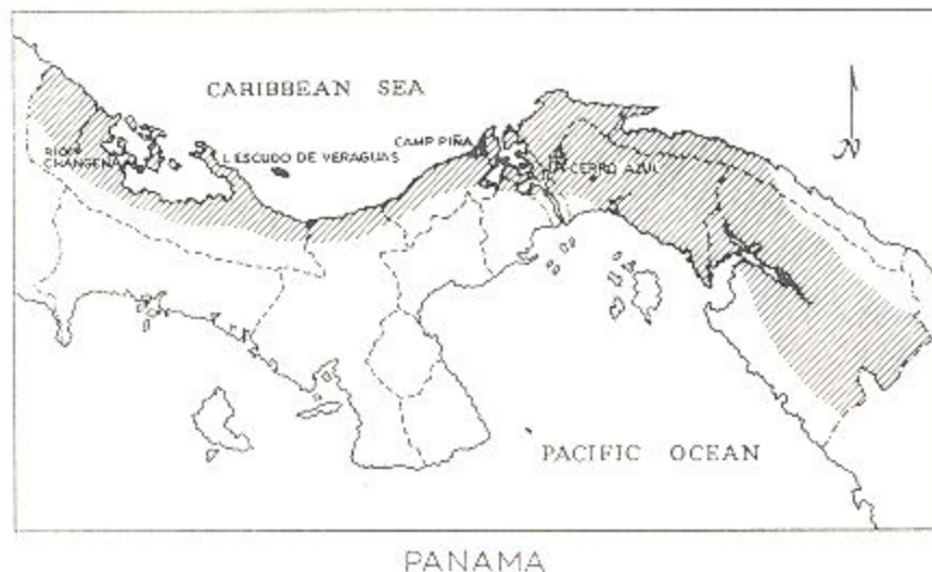
Fig. 5. Map of Panamá showing the known range of Hoplomys gymnurus and the localities where Hoplomyophilus naticus has been collected.

segments. The female genital area (Fig. 4) presents lateral gonopods provided with setae, preceded by latero-marginal group of setae. Caudal region separating gonopods having one marginal row of six medium-size setae and about two rows of minute setae accompanied by a few short ones. A patch of about ten small spicules is present at the middle of caudal area near its margin.